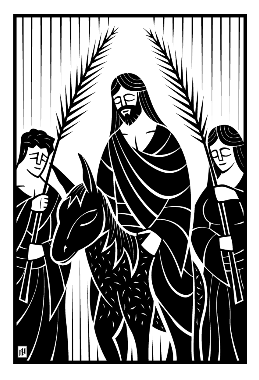
SHINING MOUNTAINS LUTHERAN CHURCH Bozeman, MT